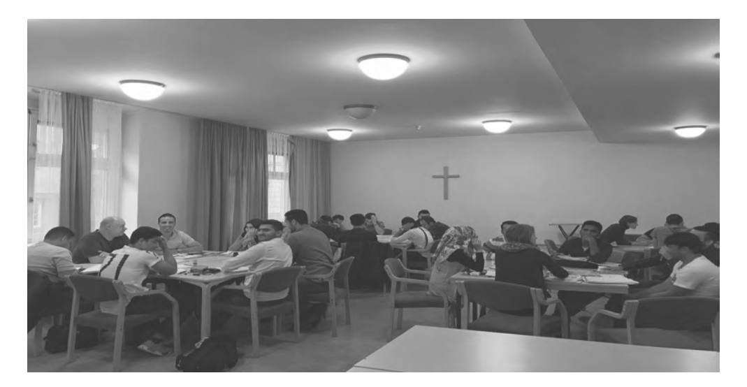
Figure 1. German course participants and volunteers – group setting. Each table is one group at its own level

Each course starts with the short (15-20 minutes) briefing with the volunteers about the previous day, exchanging the important information about the course and the course participants and with a short Salesian thought. During that time the volunteers are served coffee and cake in order to get in the course atmosphere after the busy day. After the briefing with the volunteers, with two 45 minutes sessions and 15 minutes break in between. Each day the course break starts with a short silent prayer for peace, where everyone is invited, each in his or her way, to pray in silence for peace or some other concern. After the course finishes volunteers come together for another 15 minutes (sometimes even longer) for the short debriefing. Everyone has an opportunity to express his or her observation, problems and suggestions for the next day and the course improvement. Figure 1 shows the typical course setting during one of the days.