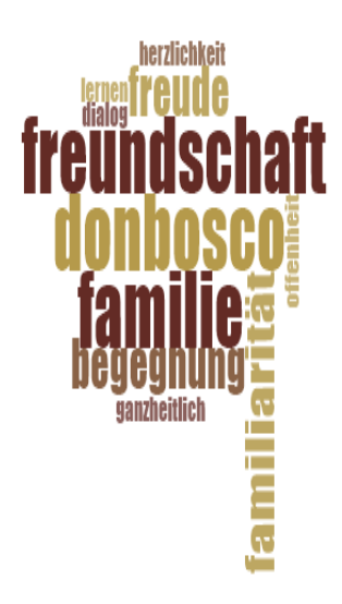
Figure 3. Word-Cloud shows the words used most frequently. As the interviews were conducted in German, the words in the cloud are in German. The larges words are FRIENDSHIP, FAMILY and DON BOSCO

One can see that as already mentioned before the most frequent words are family and friendship.