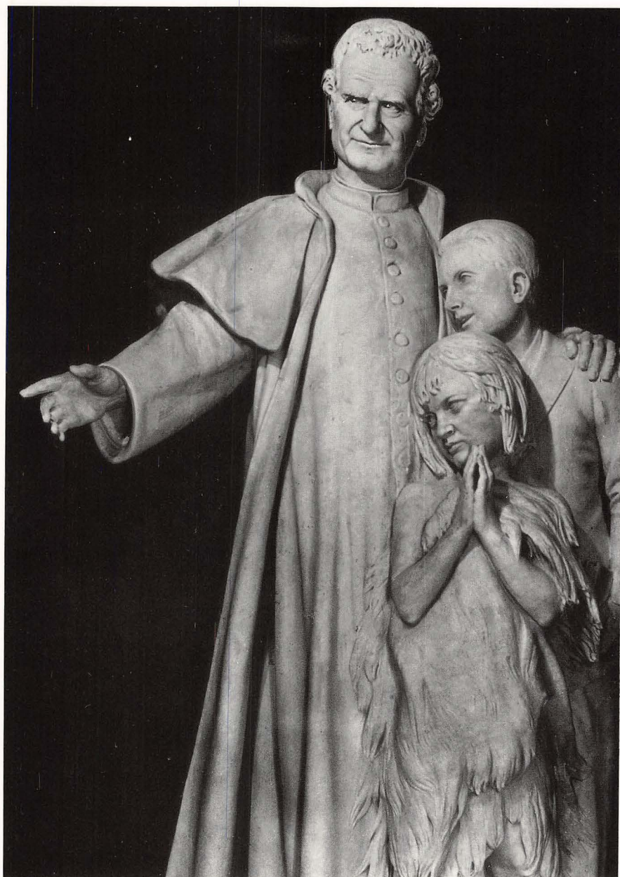
Don Bosco's Statue In St. Peter's, Rome